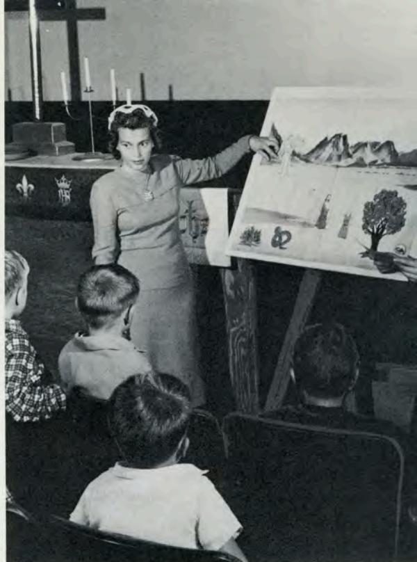
Small UTO grants supply missionaries with visual aids that help in teaching Old and New Testament stories

church work at all, if someone hadn't mentioned it to me at just the right moment," said a woman missionary. Her statement is echoed by many other church workers to whom the opportunities for work in the Church were presented by fellow Christians.