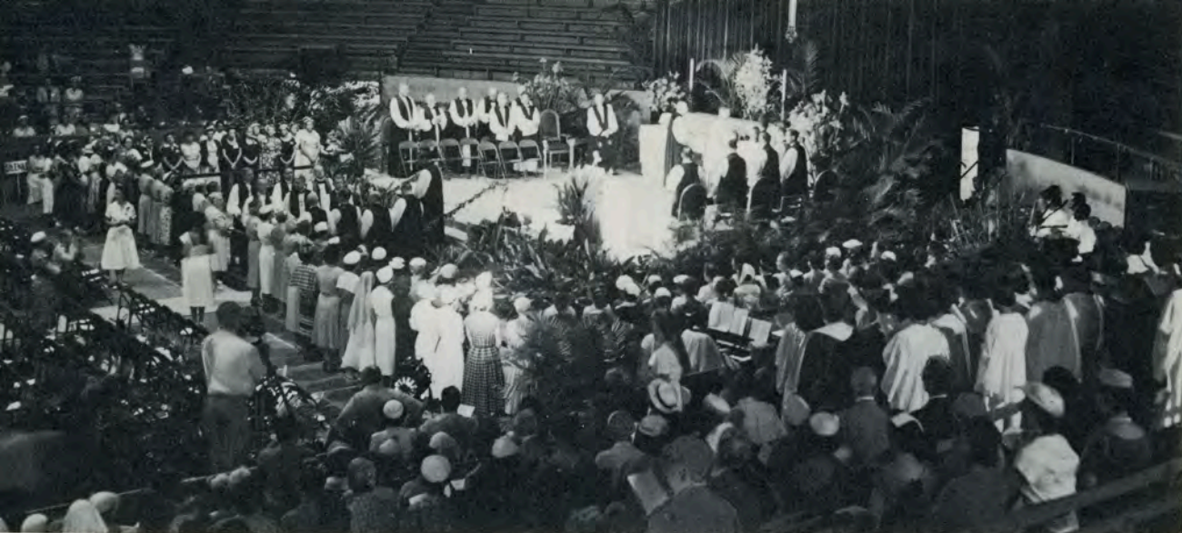
High point at Triennial Meeting in Honolulu was the presentation of the United Thank Offering

daddy," said the child, "it doesn't work unless you say a prayer!"