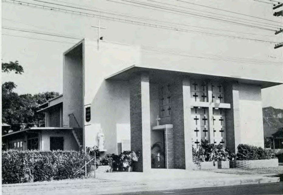
St. Mark's Church, Honolulu, a combination of old and new architecture, received aid from the UTO. Many bricks for this building were made by parishioners.

THE SECOND LARGEST CATEGORY IN THE 1955 United Thank Offering budget is the one entitled SPECIALS: CAPITAL GIFTS. The largest item in this section is for new buildings and property.