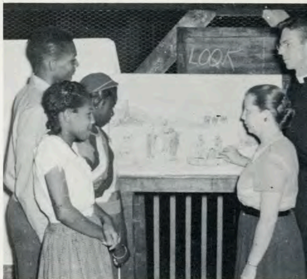
A demonstration to prospective teachers in the use of their new flannelgraph at the school of religion, St. George's Church, Almarante, Canal Zone.

Through these gifts; through its gifts to Cuba, where the United Thank Offering will help the Church to acquire property for two schools; through its gift to India, where it will help to build a chapel for a woman's college; and through the item for new buildings and property, the United Thank Offering will demonstrate tangibly the concern of the women of the Church for the Church's Mission in innumerable countries. In still another way, however, is it demonstrating this concern: through