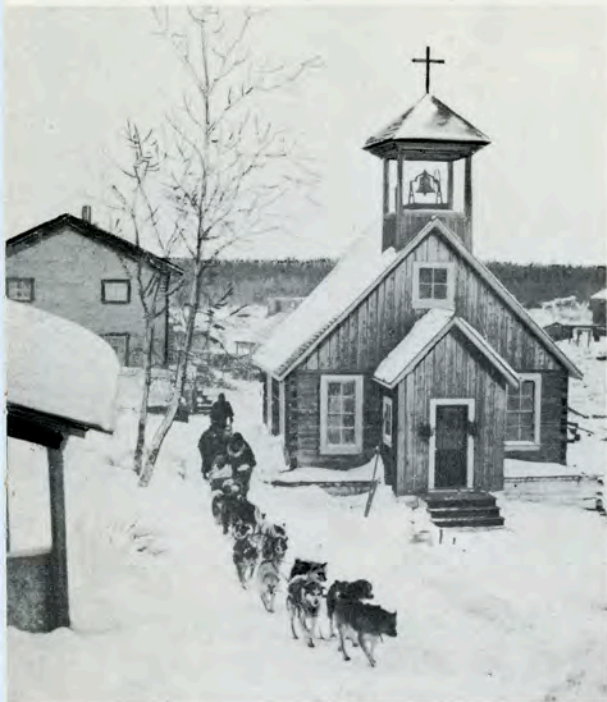
Part of the first United Thank Offering was used to build Christ Church at Anvik, Alaska, in 1889