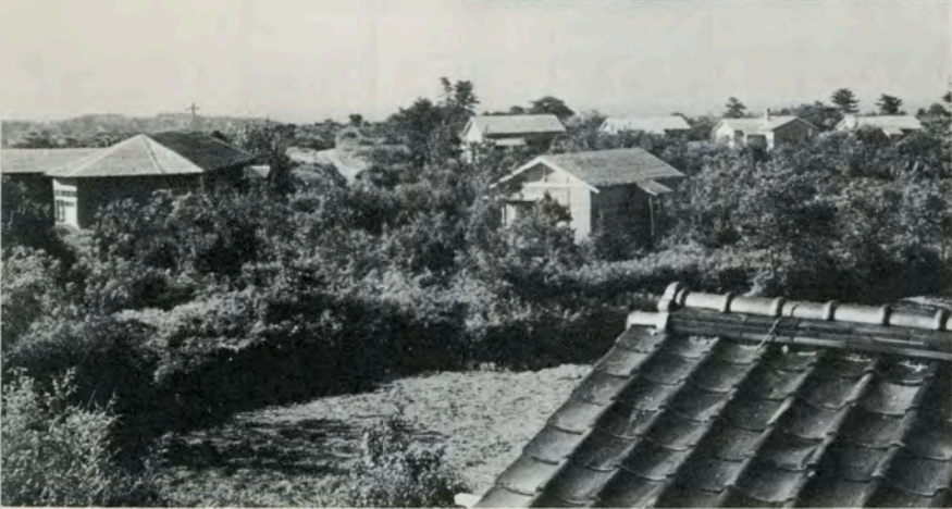
The Christian Rural Center Tarumi, near Kobe, Japan. The view shows six of the houses and the hall built by work campers.

German businessmen and members of the diplomatic corps.