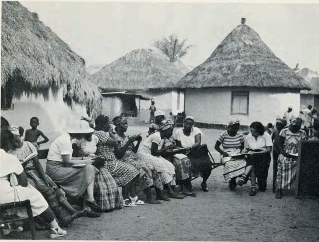
Many hitherto isolated areas of Liberia have become accessible by new roads and railways. Outdoor classes for adults are spreading in these regions in an effort to spread the plan of "each one teach one."

hiana; Christian Medical College, Vellore; Delhi School of Social Work; St. Christopher's Training College; and Women's Christian College, Madras.