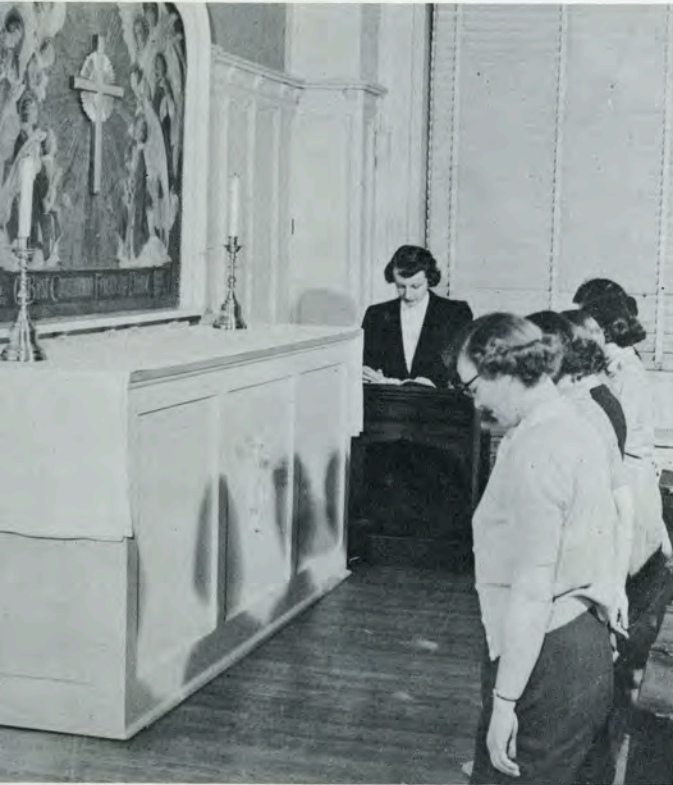
Chapel, Windham House, National Council graduate training center, New York, where daily prayers are led by the students who are preparing for church work.

Class at St. Margaret's House, Berkeley, Calif., National Council's West Coast graduate training center for women who wish to make church work a profession.