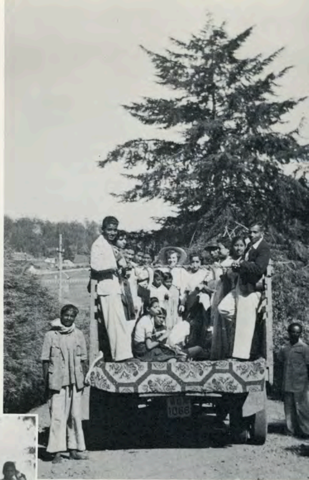
Teachers and students of the School of Social Work, Delhi, India, on their way to a day's outing. It turned out to be a "busman's holiday," for they ended by demonstrating techniques in social work to remote villagers.

THE TWO INTERCHURCH projects in the United States in which the United Thank Offering is sharing, through the Division of Home Missions of the National Council of Churches, are work with migrants and work with low-income farm families.