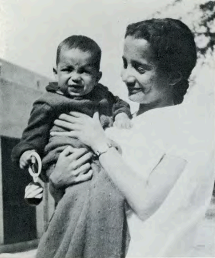
Field director of the School of Social Work, Delhi, India, holding one of the thousands of homeless children, victims of India's postwar internal strife.